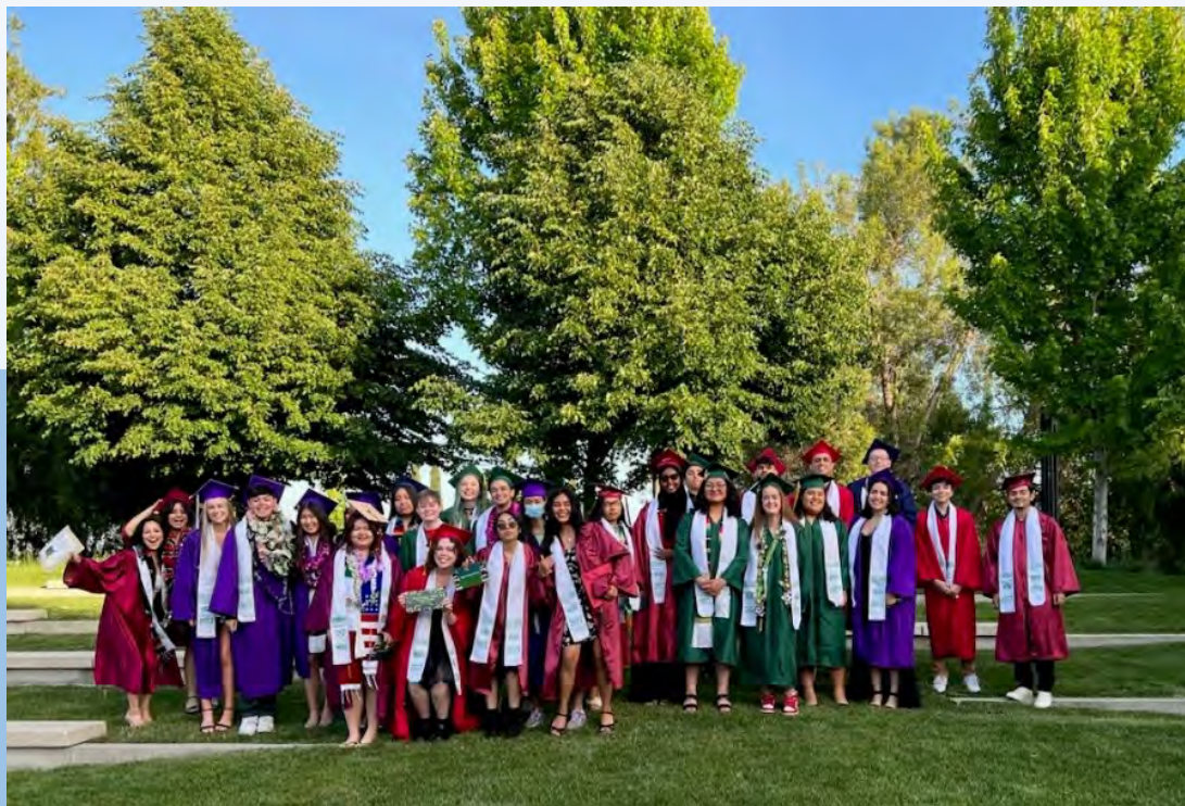
DVC's 2023 College Now graduating class.